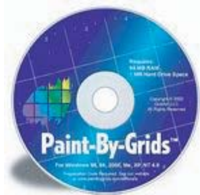
Part # A-SOFT-C3

Draw and paint like the professionals! Used by Leonardo Da Vinci and other masters of art to draw and paint with remarkable results, gridding is a technique that helps anyone, regardless of artistic ability, conquer the difficult task of drawing and painting with accurate perspective and shape. Historically, gridding was complex due to math requirements, but we've designed an easy to use gridding system that can be used by anyone regardless of skill to obtain lifelike results in drawing and painting. Gridding is the Artists' secret to accurate perspective and shape.